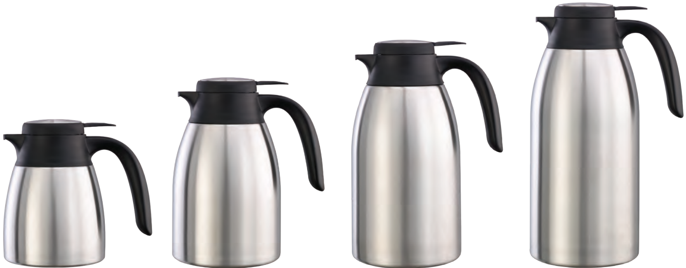
FCC06SS 4.75" X 6.75" X 6" 0.6 Liter (20 oz.) Brushed